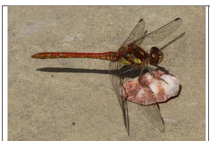
Common Darter Can be seen away from water anytime between May and November