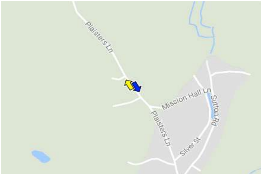
Location of equipment

Survey conducted by Dorset County Council equipment 18 th -24 th September 2017 Equipment located on Plaisters Lane, between Sutton Close and Sutton Court Lawns.