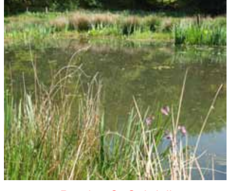
Pond at St Gabriel's

With so little rain since the beginning of March, I have become concerned at low water levels in Dorset streams and ponds and the effects on animal communities associated with water. I was pleased to receive the National Biodiversity Newsletter, which ran a feature on ponds. It was timely that the latest edition of the NBN News has an update on ponds: