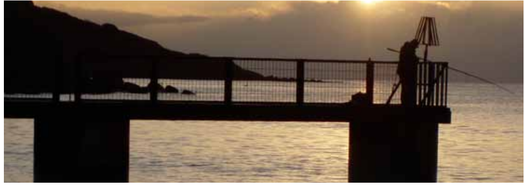
2001-11. Ten year anniversary of the Dorset World Heritage Coast