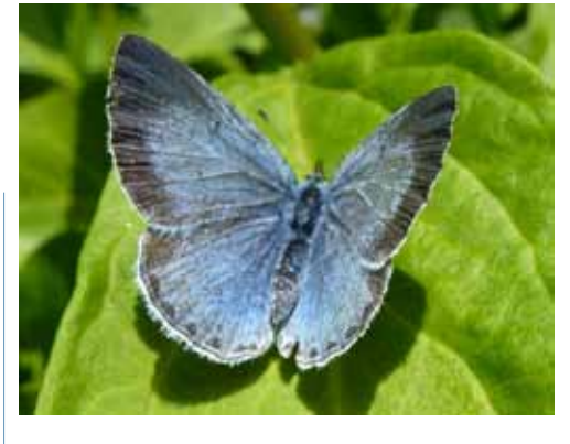
Holly Blue