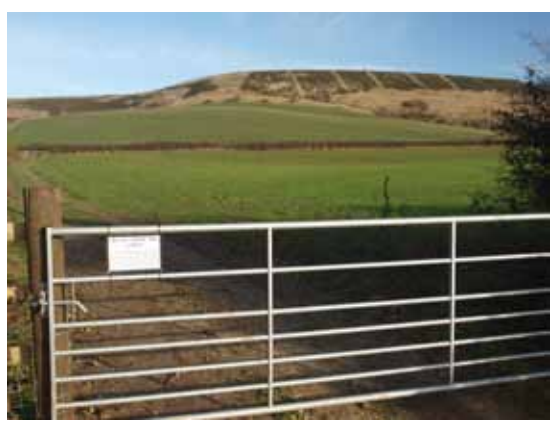
Northdown Farm 2011

During the winter of 2010-11, Natural England managed to borrow some ponies to graze the newly fenced area on West Hill. These certainly assisted by removing some of the rank Tograss, we were disappointed that so far this winter they have not re-appeared.