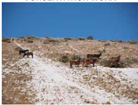
West Hill December 2010.

During the winter of 2010-11, Natural England managed to borrow some ponies to graze the newly fenced area on West Hill. These certainly assisted by removing some of the rank Tograss, we were disappointed that so far this winter they have not re-appeared.