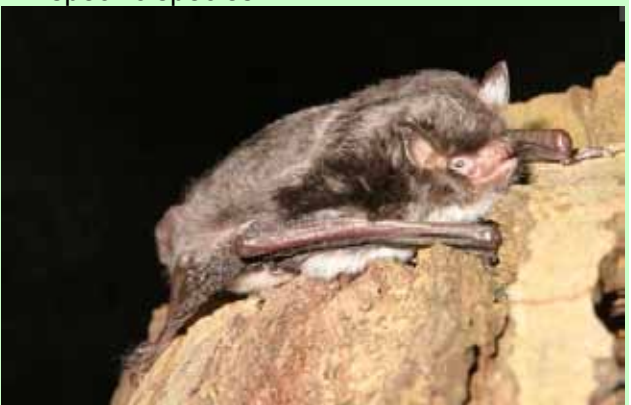
Daubenton's Bat Image Wildlife Extra. We have been able to get some good recordings of common pipistrelle, soprano pipistrelle, serotine, grey long eared, daubentons, natterers and noctule bats.