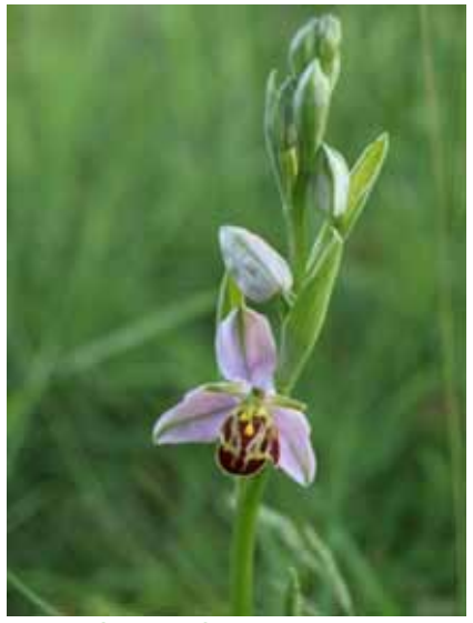
Bee Orchid © John Newbould Turned up in a lawn on Puddledock Lane in May 2011.