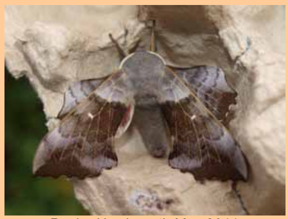
Poplar Hawk-moth May 2011.

The mild later winter and spring meant that my actinic trap was out earlier than usual, whilst the warm autumn meant that I kept going until early November with Feathered Thorn being the last new species recorded. We also had our fair share of the more common species with the perennial favourites such as Poplar Hawk-moth