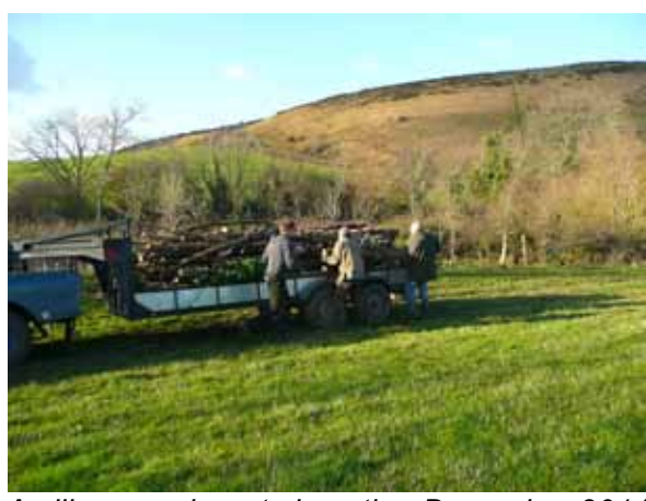
A village work party in action December 2011

In early part of 2011, the new owner of Northdown Farm replaced arable fields with grass, and subsequent conversion to beef cattle. New gates have been installed along the western track. It is important that these are kept closed in order that cattle are grazed in the correct area, including the gorse scrub area of East Hill. Gradually the Gorse mosaic will be softened over a period as part of a chalk grassland restoration.