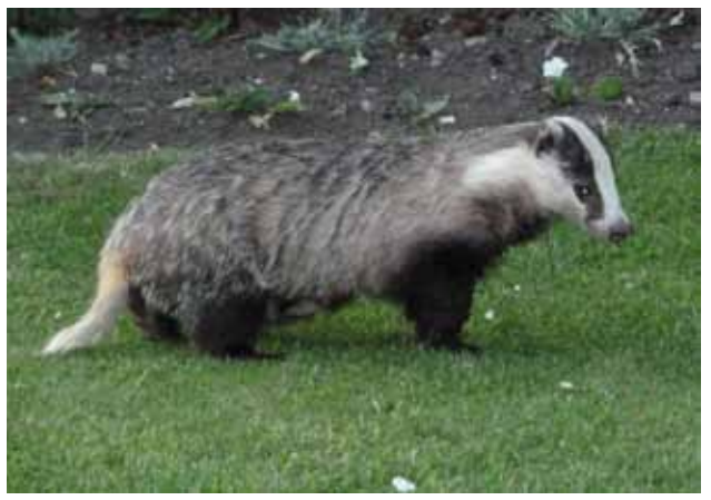
Badger

confirmed that a significant population of wood mouse continues to thrive and have also indicated an increased number of bank voles, although with a continued absence of shrews. This data has been submitted to the British Mammal Society for recording and the Dorset Mammal Recorder.