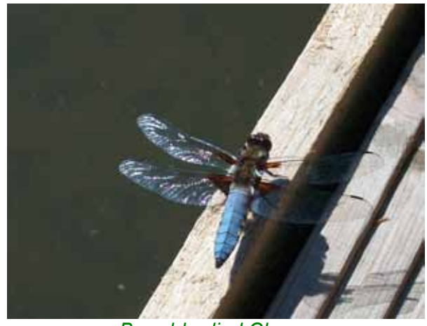
Broad-bodied Chaser © Peter Shreeves

Gardens are an important resource for wildlife with orchids turning up in lawns; even new garden ponds are soon humming with wildlife including frogs, toads dragonflies, butterflies and moths.