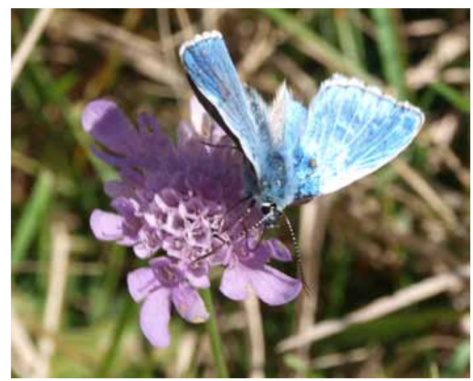
Butterfly Records are sent each year to the Dorset branch of Butterfly Conservation.