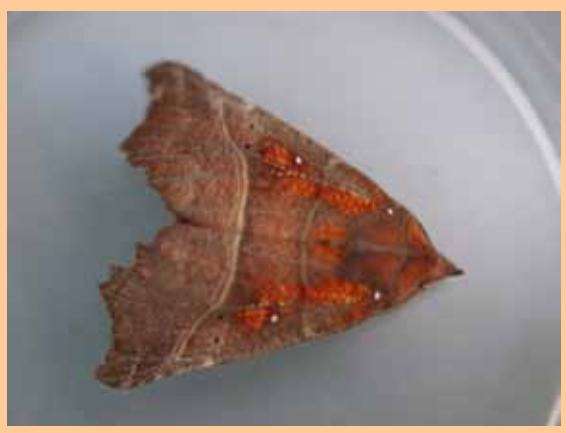
The Herald April 2011.

Our moth-recording season started on 18<sup>th</sup> February in 2011 and finished on 2<sup>nd</sup> November. I am still waiting for the final lists to come in, but I have over 650 records, mostly from gardens but also from the waterworks. Until the complete list is available, I have not done a detailed data analysis, but a quick count-up shows eighteen new species so far.