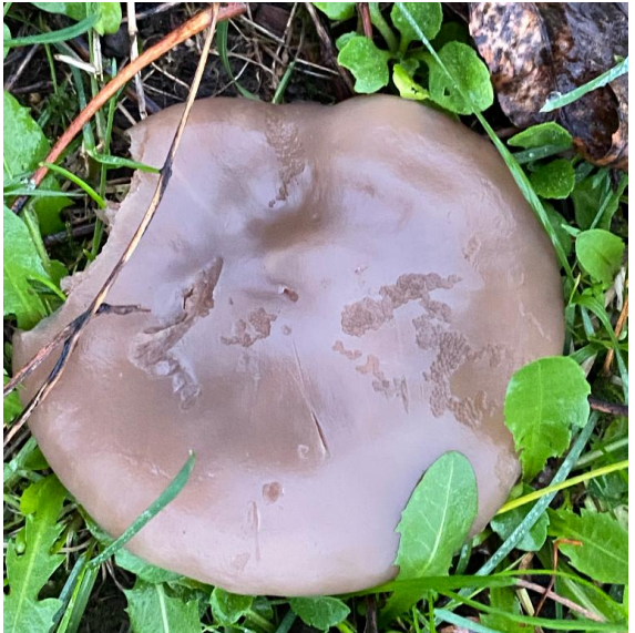
Slimy waxcap (Not to scale)