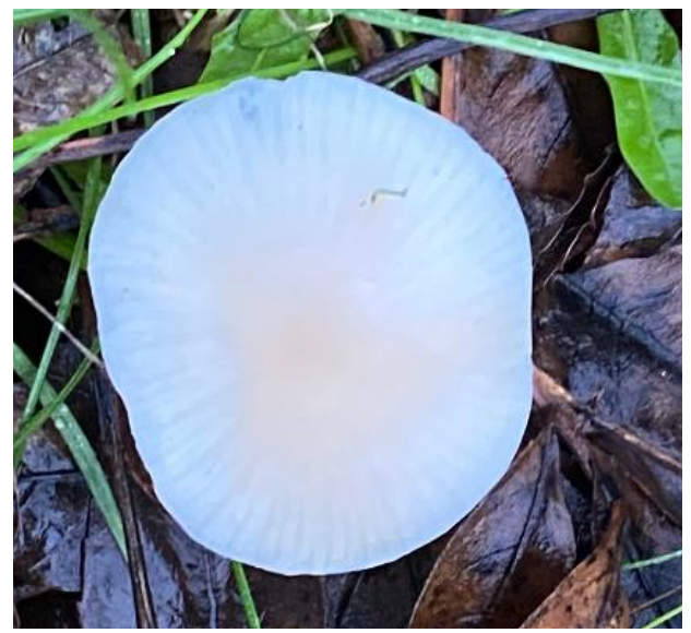
Snowy waxcap seen here two years ago

One of the most important surveys we do at this time of the year is to survey for waxcaps in unimproved, unploughed meadows: Amazingly, under an ash at the junction of Coombe Valley road and Littlemoor Road SY69682837