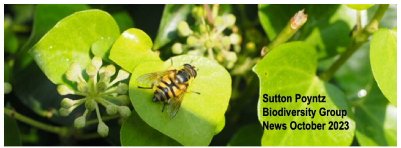
Garden Bird Watch this month starts 22<sup>nd</sup> October to 29<sup>th</sup>

The banner photograph shows a hoverfly about to nectar on ivy. My impression for pollinators in 2023 in that the number of bees, hoverflies, moths and butterflies are well down. Apart from the hottest June for years, the weather has been quite mixed and unkind for insects. Our moth recording efforts are well below previous years but I have yet to collect all our data in.