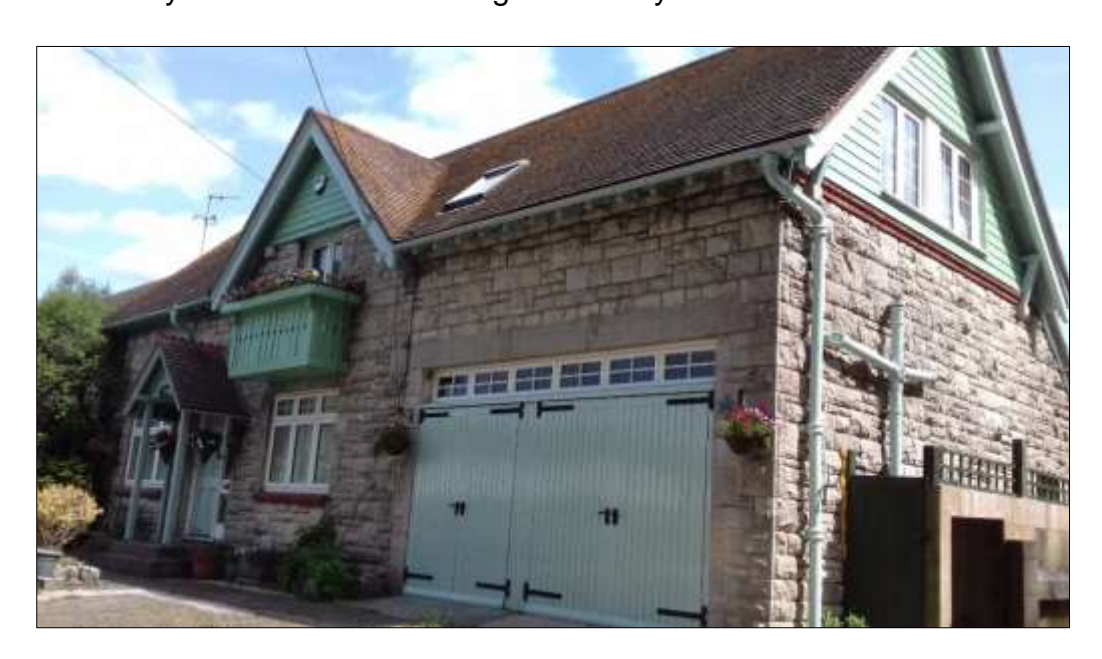
Kim Sankey RIBA, Architect & Historic Buildings Consultant

24. The Coach House was built as a service wing to the Springhead, of the same materials and style albeit more diminutive, originally providing ancillary accommodation for carts, horses and grooms accommodation in the hay loft above. The cart shed retains the original double doors and fan lights over, and latterly housed vehicles. It has a charming appearance with the timber boarded gables as opposed to half-timbered gables of the pub but is more domestic in character retaining the essence of its former use. Included for social and communal value and aesthetic interest by a local architect George Crickmay.