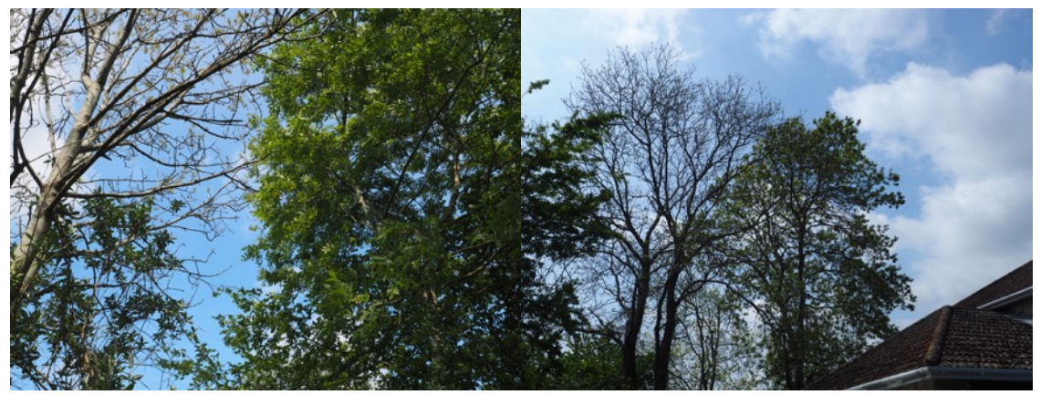
Various trees on Puddledock Lane

in a hedgerow side by side. The young one is still in good leaf. Trees adjacent to Sutton Farm appear to be in good shape – see the photograph below: Driving towards Osmington, a number of trees adjacent to the main road have succumbed as the ash along side the brook to the east of the stables. Driving along Chalky road from Broadmayne a number seem affected.