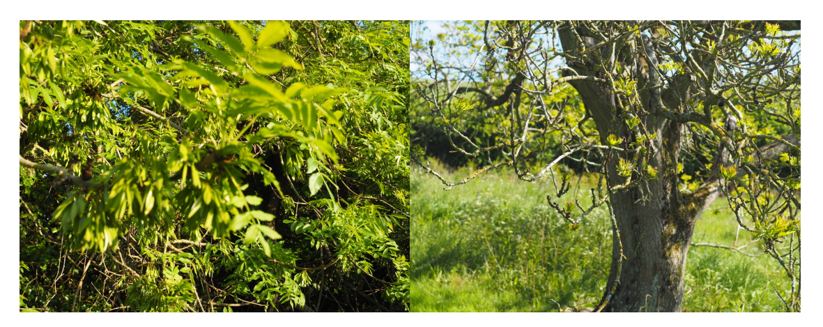
Good trees from Sutton Farm