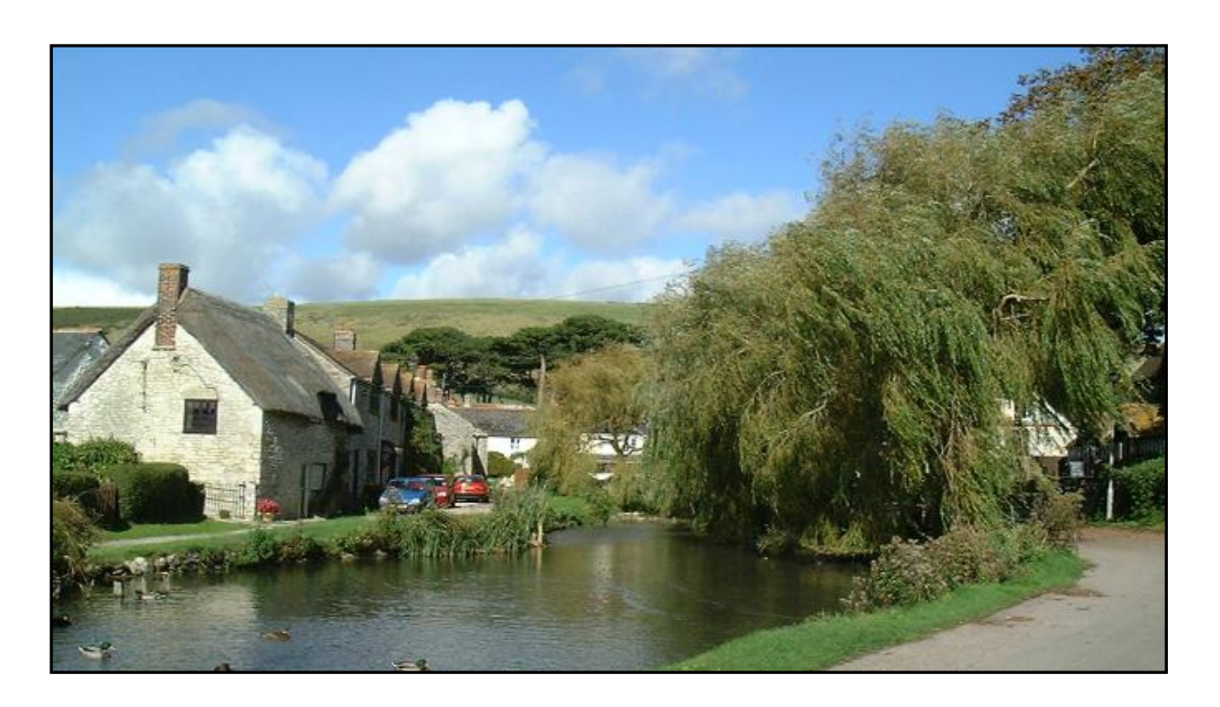
So what now? Join the SP Society!

Membership is open to all local residents - over 75% of households belong and the number is growing - plus those who live nearby who have the interests of the village at heart. The yearly subscription is a mere £5 per household, which puts you on the list to receive frequent Newsbite emails which tell you all about local events.